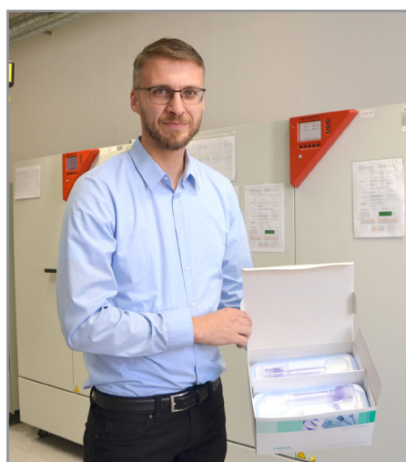
> Trocars and their packaging ready to go into a constant climate chamber for testing.

Aesculap's research and development activities use nine different BINDER constant climate chambers, currently serving as storage locations for numerous packages with trocars – which are endoscopic instrument ports used for accessing the abdominal region in minimally invasive surgical procedures.