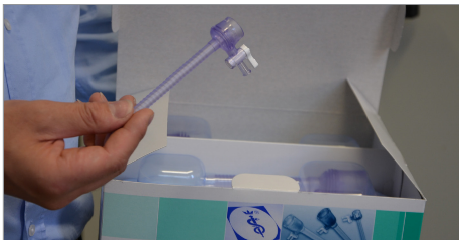
› The color of the instruments has to remain unchanged. Bernd Blender takes a look during the test process.

The packages will be left inside for a little over a year before the experts take them out and inspect them for changes, a process that simulates five years of use in real time. The KMF 720 constant climate chamber, one of the items of equipment in use, achieves this by simply maintaining a constant interior environment with a temperature of 45°C and 35% relative humidity over 398 days.