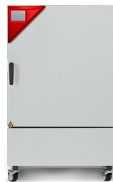
› KBF 240 model

Další informace o nabídce klimatických komor jsou zde: https://www.helago-cz.cz/eshop-kategorie-stale-klima-komory.html