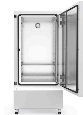
Model KB-ECO 400